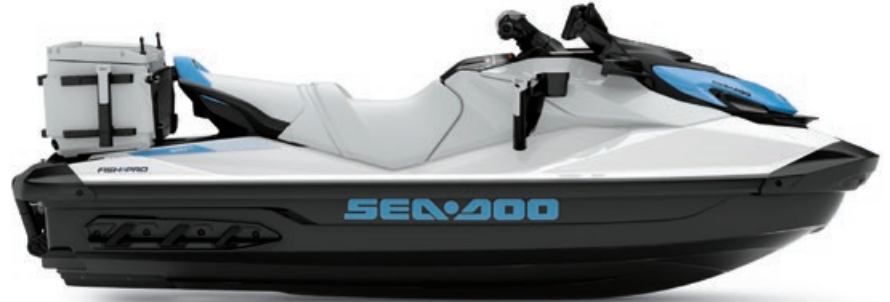
White & Gulfstream Blue